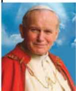
St. John Paul II

"St. Joseph was a just man, a tireless worker, the upright guardian of those entrusted to his care. May he always guard, protect and enlighten families."